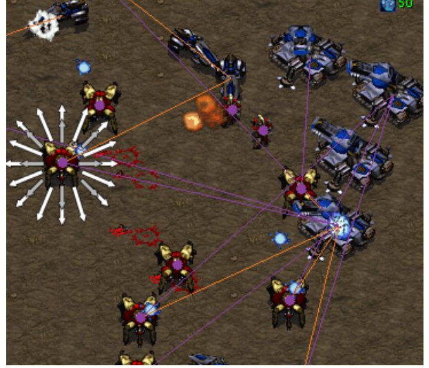
Fig. 3. Screen capture of a fight in which our bot controls the bottom-left units in StarCraft. The 24 possible directions are represented for a unit with white and grey arrows.

StarCraft is a canonical RTS game, as Chess is to board games, because it had been around since 1998, it sold 10 millions licenses and was the best competitive RTS. There are numerous international competitions (World Cyber Games, Electronic Sports World Cup, BlizzCon, IeSF Invitational,